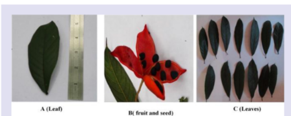
Figure 1: The Macroscopic leaves, fruits and seed of SR.