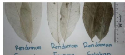
Figure 2. Immersion Result in River, Pond and Sewer Mud

In the photographic evidence, it was found that the river mud had very clean flaking tissue, as shown in Figure 2.