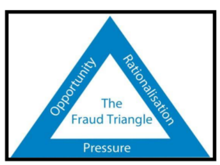
Figure 1.2 Fraud Triangle