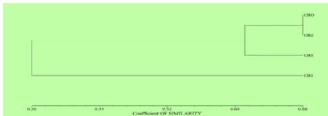
Figure 3. UPGMA grouping dendrogram according to the level of kinship in 3 Cibotium barometz accessions with the NTSYSPC, SAHN, SIM, and NTED programs.

fern), and cluster III consisted of CB3 (Caucasian fern). To see the closest kinship between CB0, CB1, CB2, and CB3 can be seen in the dendrogram Figure 3.