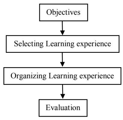
Fig. 1. Development model from ralph curriculum.

Ralph Tyler model (Basic Principles Curriculum and Instruction). According to Tyler in Ruhimat & Alinawati, there are four steps to build a curriculum development, as explained Figure 1 [6].