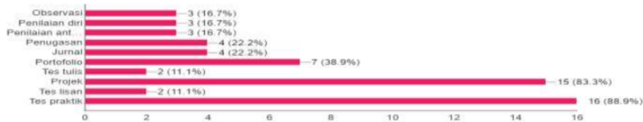
Chart 3 Survey Techniques for Authentic Assessment Competency Skills

The survey results regarding authentic assessment techniques for competency skills can be seen in the chart below: