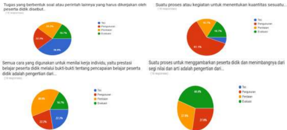
Figure 1. Knowledge of Test, Measurement, Assessment and Evaluation

In summary the results of the respondents described as follows: